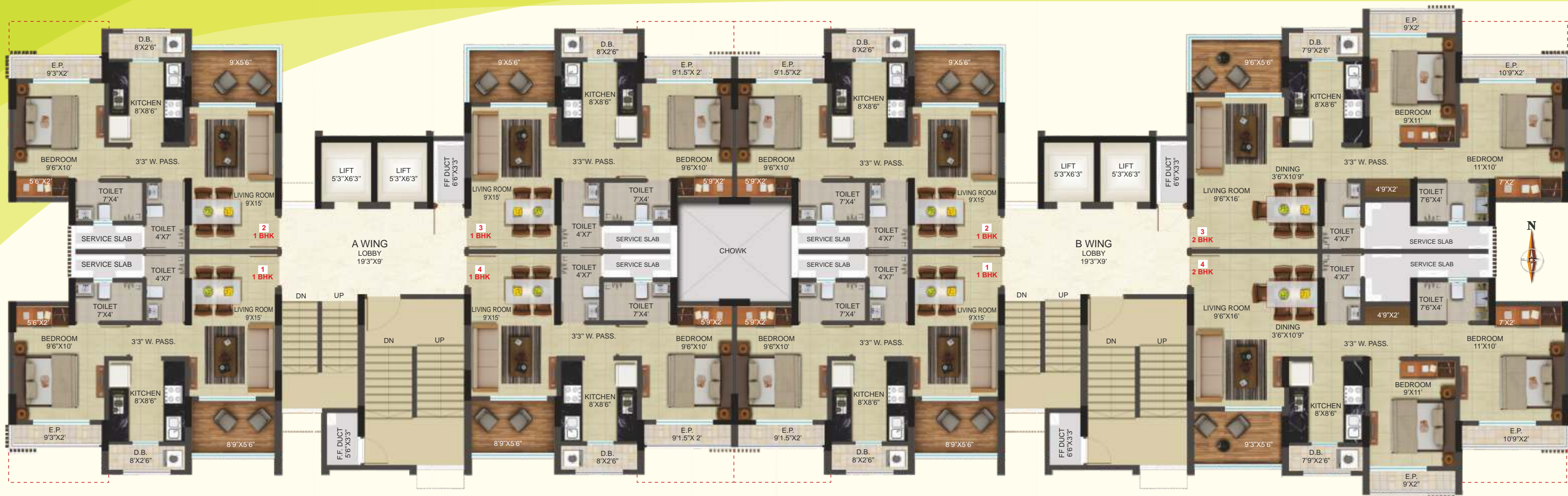
Typical Floor Plan 1st, 3rd, 5th, 7th & 9th Red dotted line indicates Patio at 2nd, 4th, 6th, 8th & 10th floor

1 BHK with 2 sets of full sizes WC's, offers the Master Bedroom