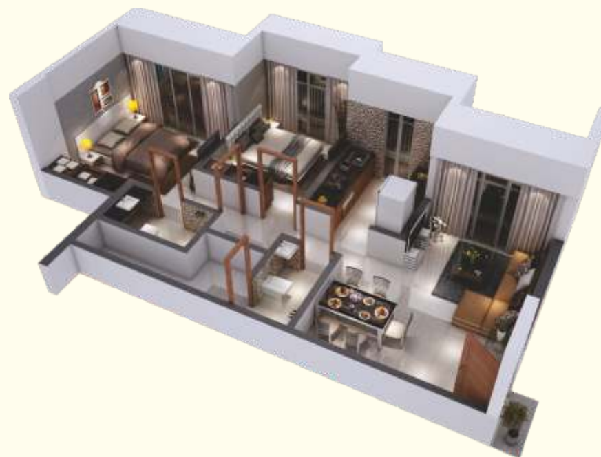
2 BHK Floor Cut