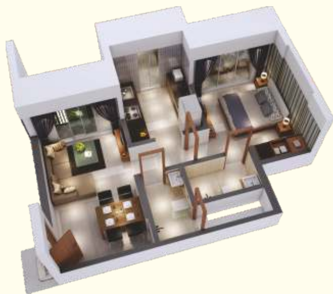
1 BHK Floor Cut

1 BHK with 2 sets of full sizes WC's, offers the Master Bedroom