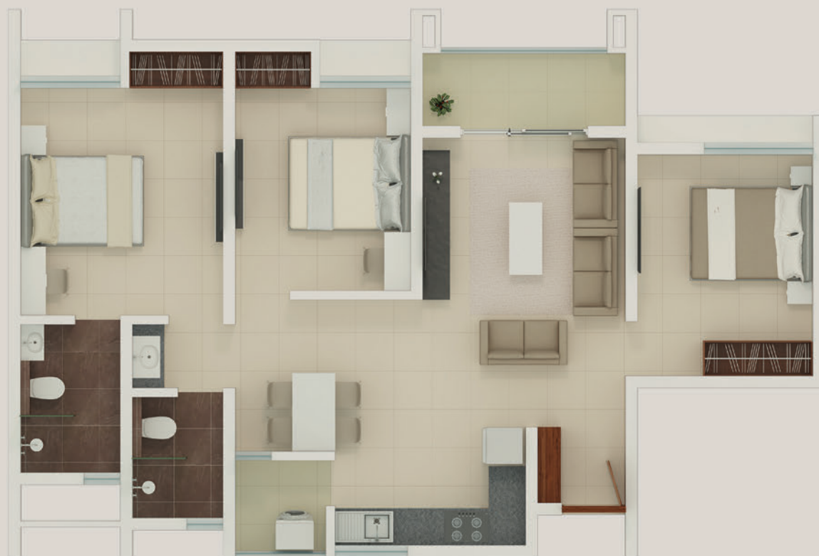
TYPICAL 2.5 BHK