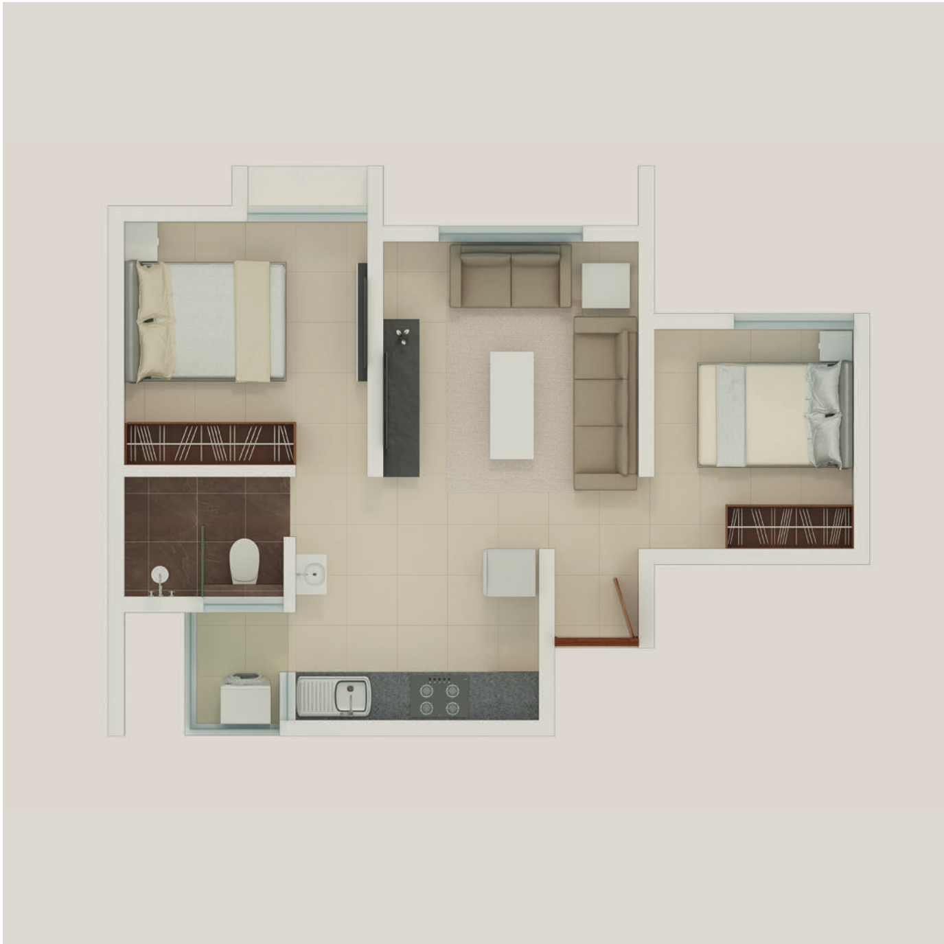
TYPICAL 1.5 BHK