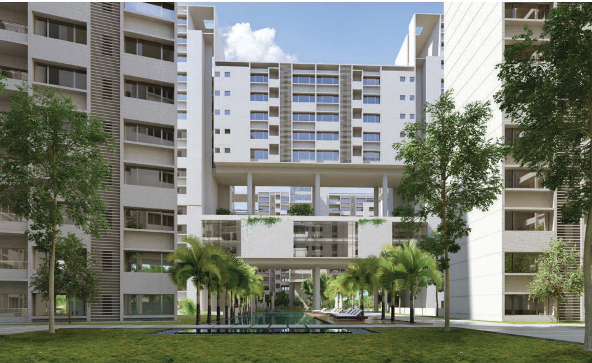
ROHAN IKSHA - BENGALURU Homes with 360° view