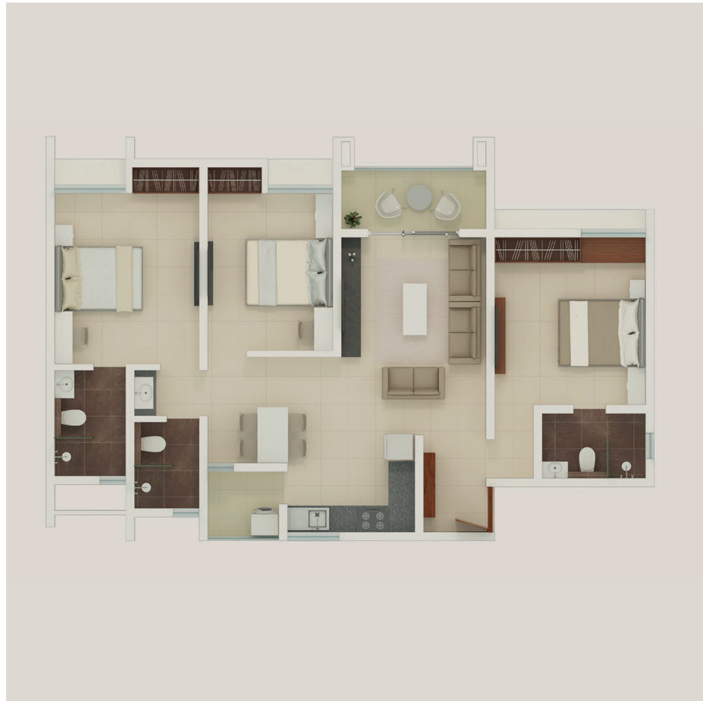
TYPICAL 3 BHK