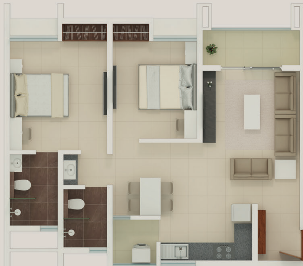
TYPICAL 2 BHK