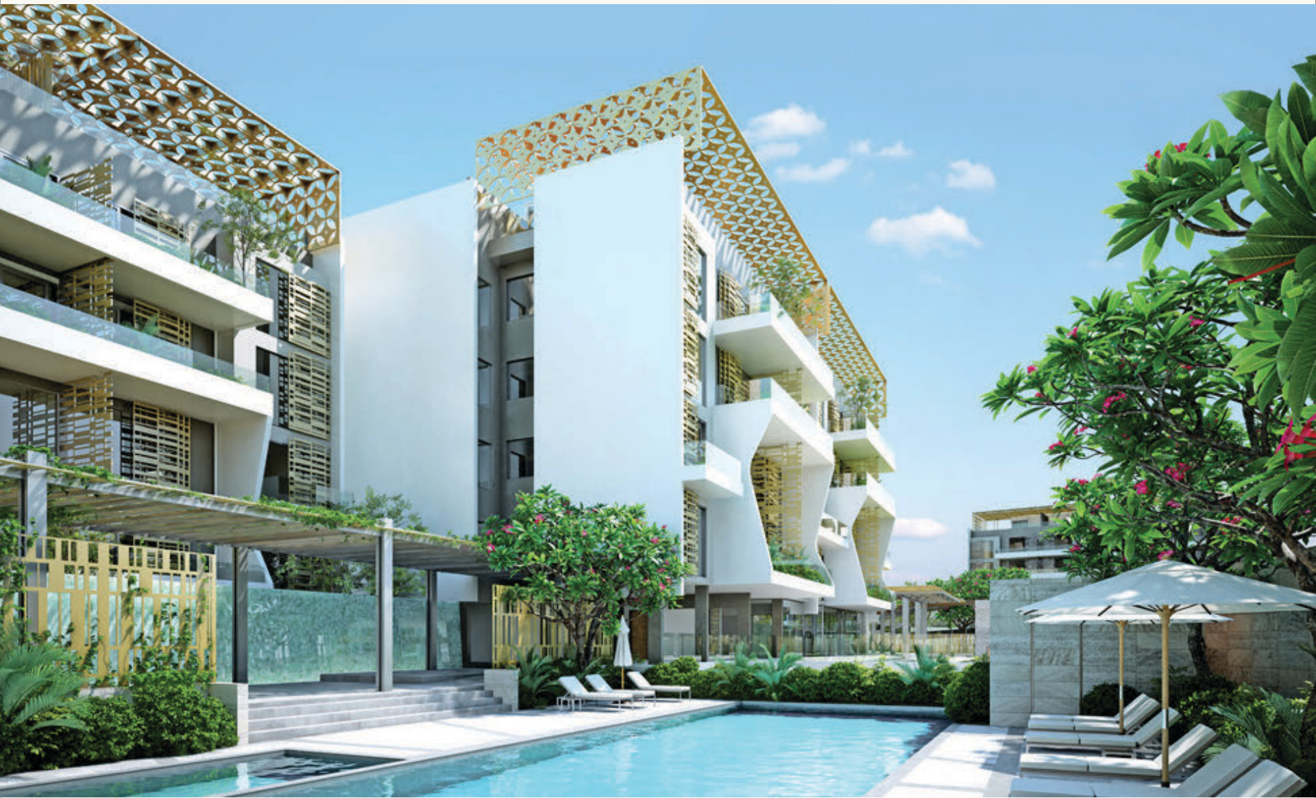
ROHAN LEHER - PUNE Extra-windy homes