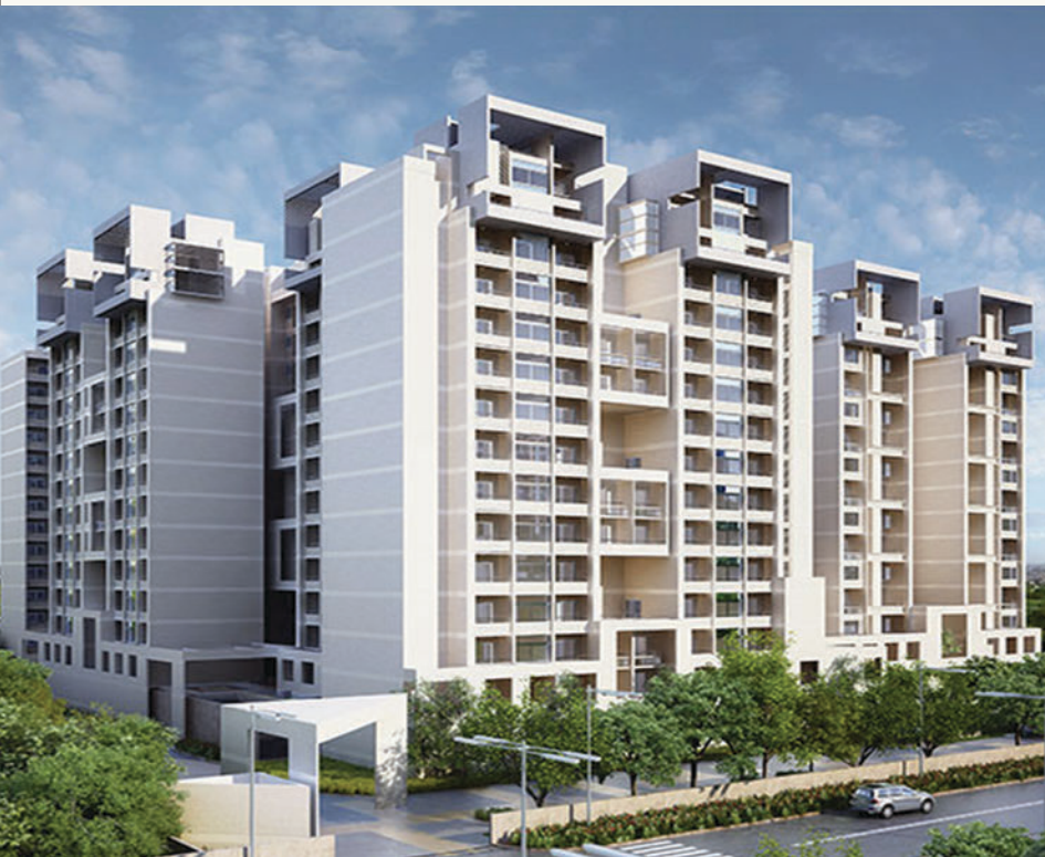
ROHAN AVRITI Surprisingly private property