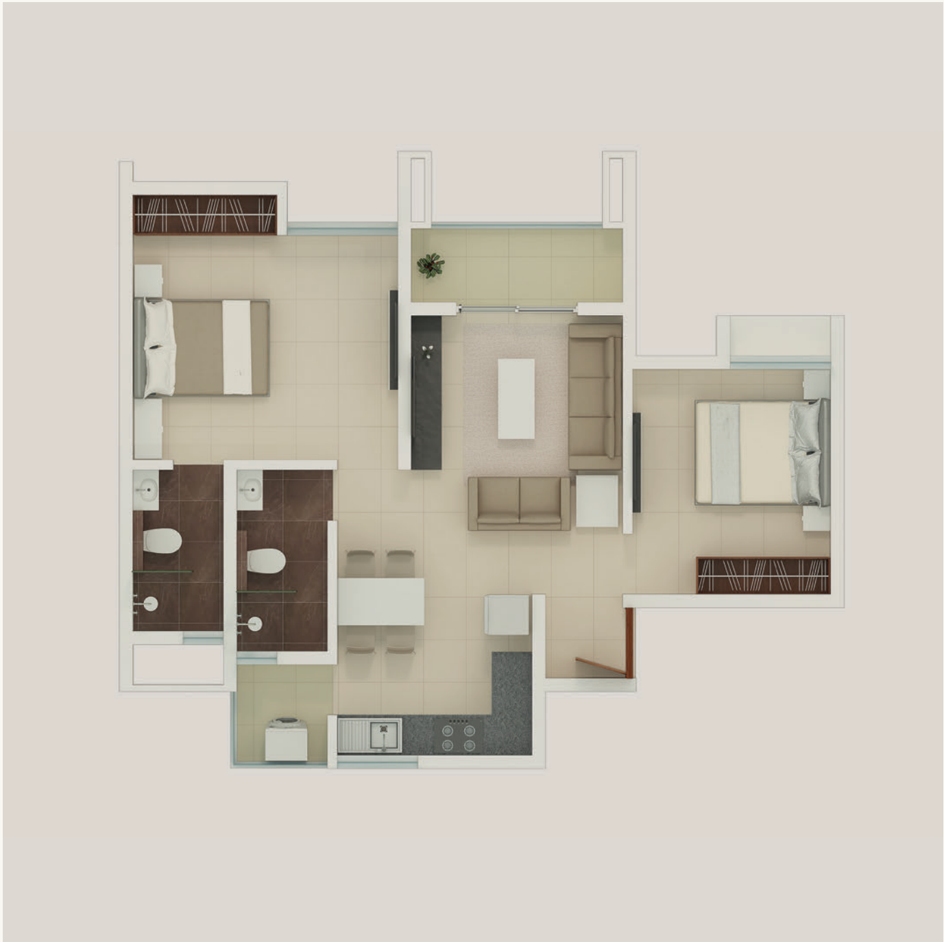
TYPICAL 2 BHK COMPACT