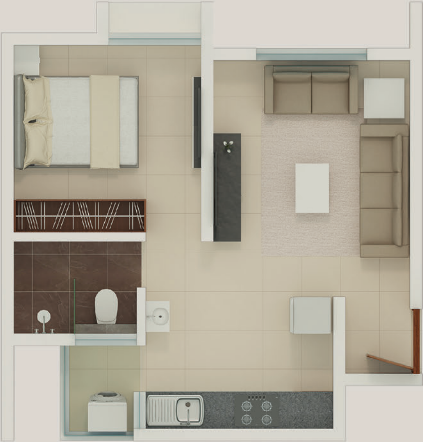
TYPICAL 1 BHK