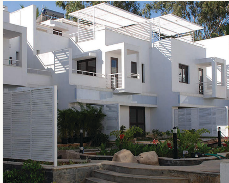
ROHAN ASHIMA Split-level open homes with less walls and more space