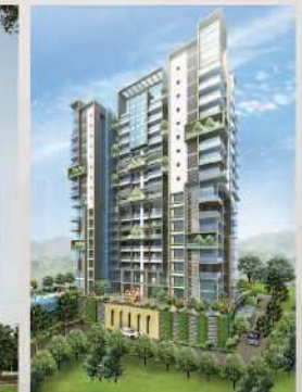
Upcoming Project in Bandra, Mumbai