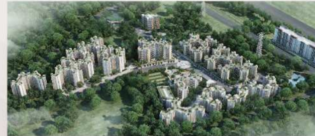
Prasadam Township - Ambarnath (E)