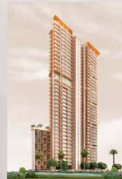
L'Amor - Oshiwara, Mumbai