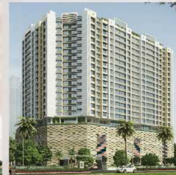
O2 - Sion, Mumbai