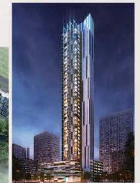
Altus - Worli, Mumbai