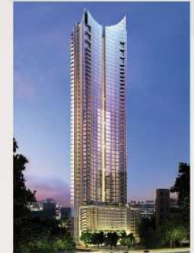
Ahuja Towers - Worli, Mumbai

Today, Mumbai and its suburbs are almost unrecognizable. The ongoing reach - for - the - skies race has completely transformed its skyline. Awe-inspiring high-rises and skyscrapers are springing up at an astonishing pace and creating new landmarks every day. And Ahuja Constructions has contributed in no small measure. Our completed, as well as current projects have brought world-class design and aesthetics, the highest construction standards and immense prestige to the Indian real estate industry.