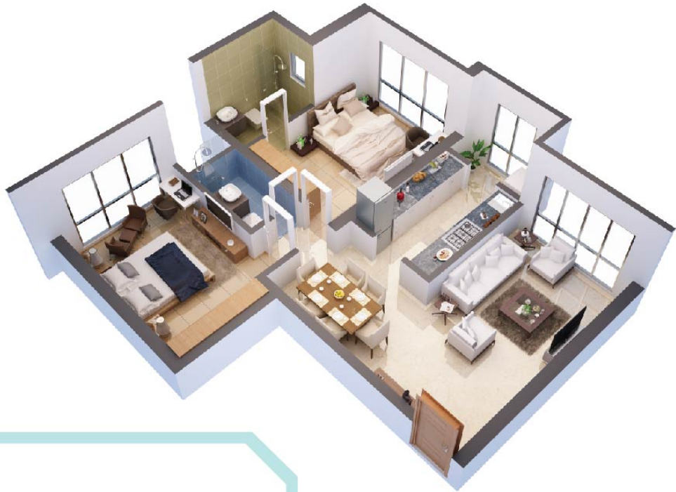
2 BHK CROSS SECTION