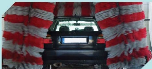
CAR WASH FACILITY